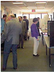
Residents and business owners learned about the Red Rock Corridor at previous project open house meetings.