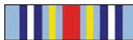
Global War on Terrorism Expeditionary Ribbon