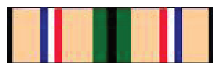
Southwest Asian Service Ribbon