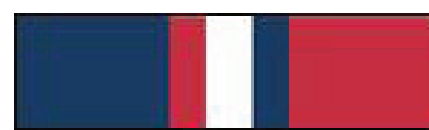
Kosovo Campaign Ribbon