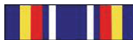
Global War on Terrorism Service Ribbon