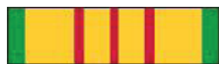
Vietnam Service Ribbon